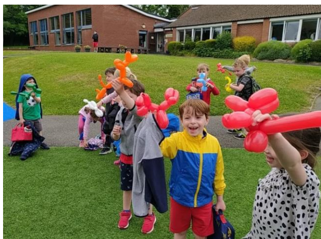
We had such a great FUN DAY!