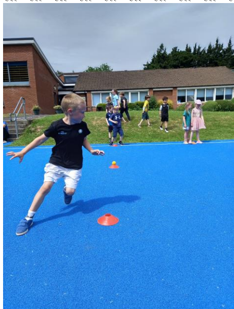
Senior Infants enjoying their Cricket session