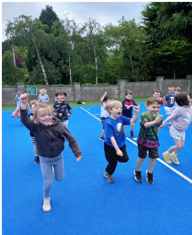
Senior Infants enjoying Zumba during Active Week