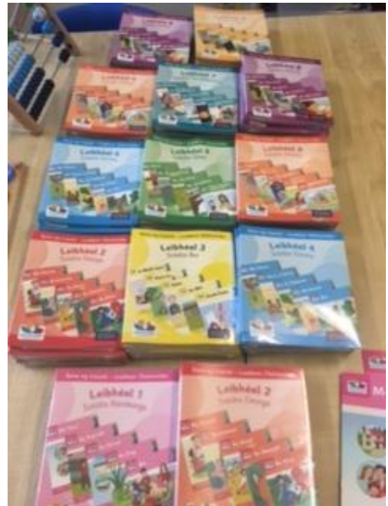
Some of our lovely new Irish reading books!