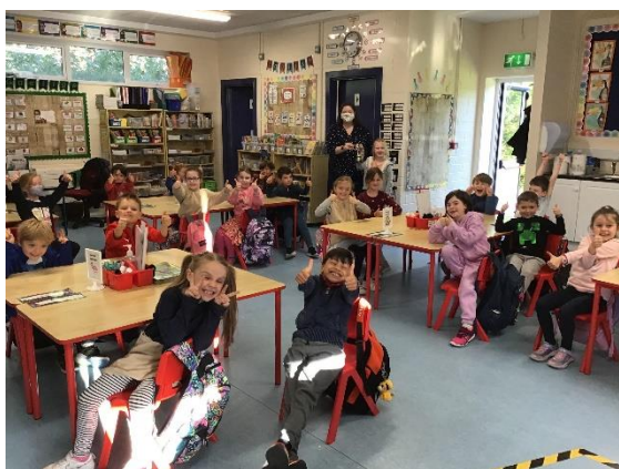
1 st Class being presented with the Class of the Month Trophy